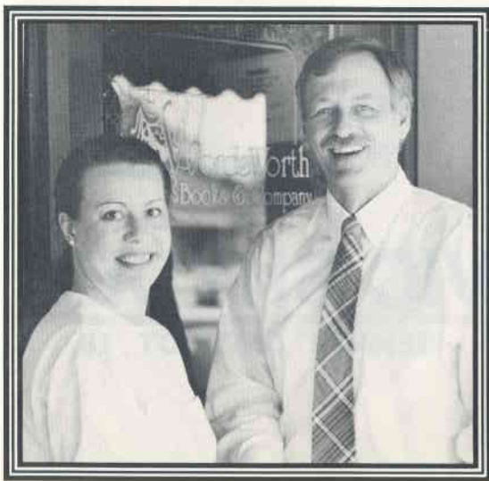
In the Heights