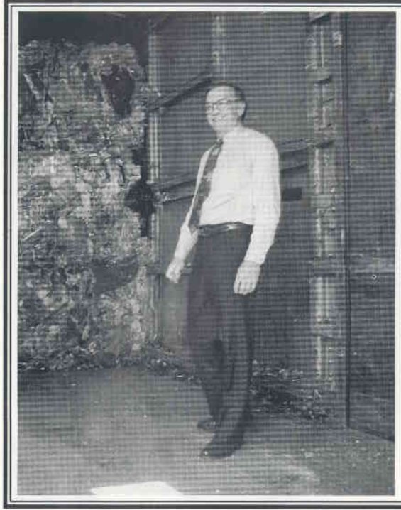
Bryant sends back train load of yankee garbage.